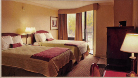
Fireplaces • Jacuzzis • Luxury suites