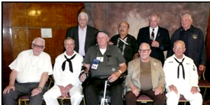
The guys of B Division