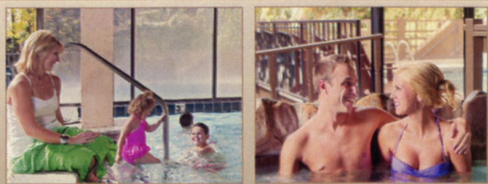
Indoor/outdoor pool and Jacuzzi