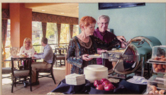
Complimentary continental breakfast